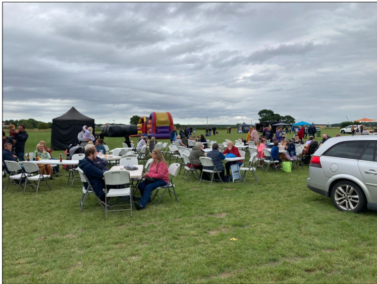
St Oswald's Feast Day 2021 Photo

The last few years have been a very challenging for our community and thankfully with COVID restrictions being lifted, Bardney Group Parish Council are looking forward to hosting and welcoming you to many more St Oswald's Day Feast Events in the years to come!