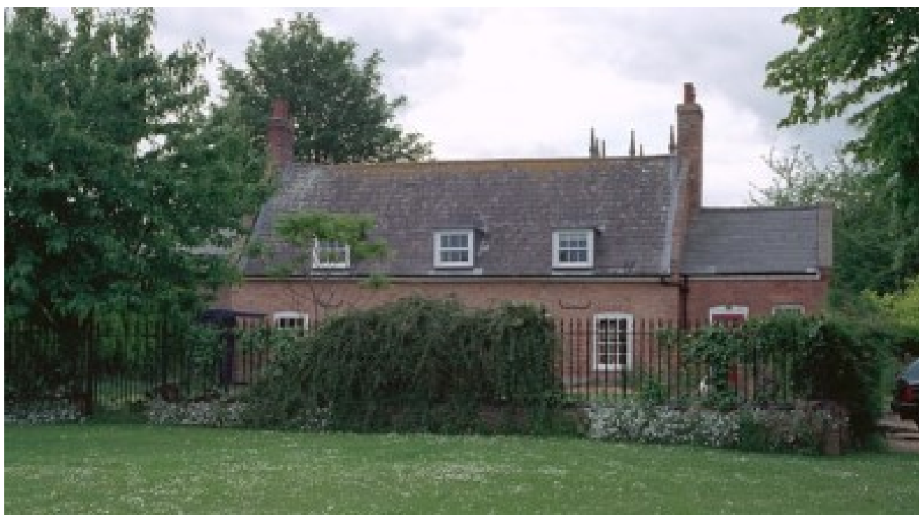
Bardney School Museum