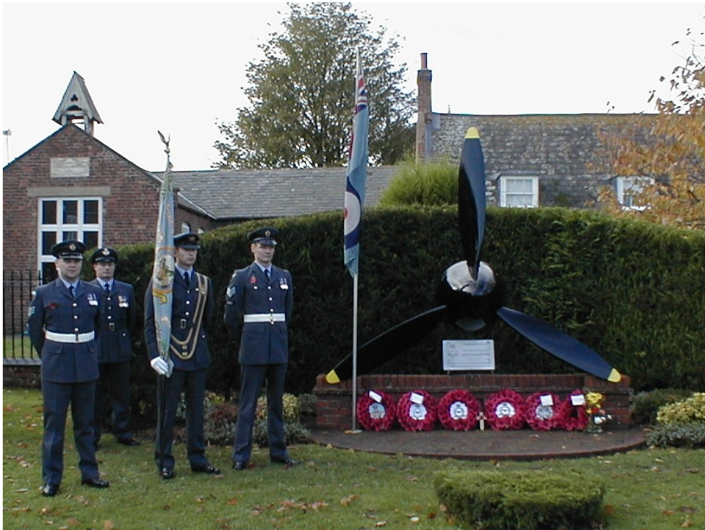
The IX(B) Squadron Standard Party and Memorial on Remembrance Day 2002