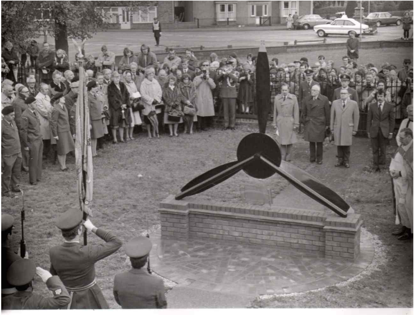
The dedication service - Sunday 19 October 1980